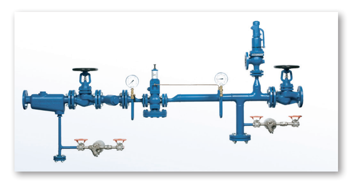
7. Pressure reducing station

Pre-assembled stations including matched products to condition the fluid prior to controlling its temperature, pressure etc., or measuring its flowrate. Includes all necessary downstream products.