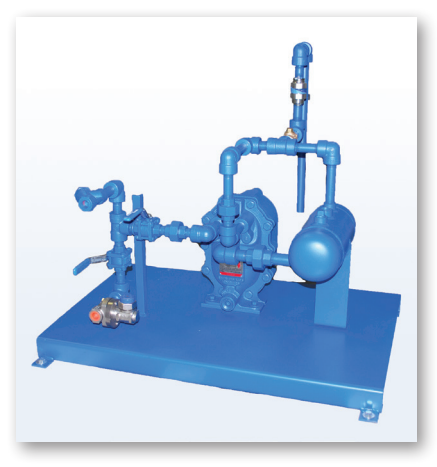
6. Pump and pump trap packaged solutions for condensate management

Condensate pumps with steam trap and / or receiver for the effective removal and return of condensate.