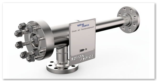
5. Steam Jet Thermocompressor