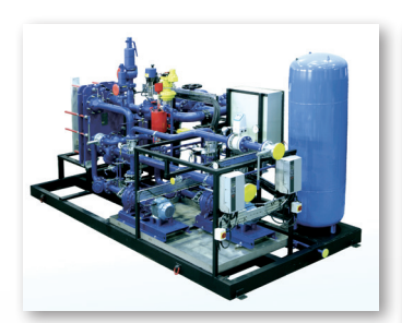
2. Custom heat transfer solutions