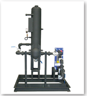
3. Heat recovery packages